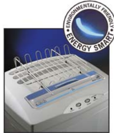
Adjustable computer forms top shelf (Space Saving Design). Integrated sliding flap makes Floppy-Disk and CD shredding easy