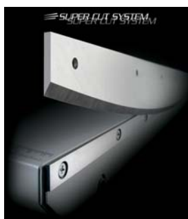
SUPER CUT SYSTEM Carbon hardened steel blades and counter-blades with 65° sharpening for long-lasting cutting operations