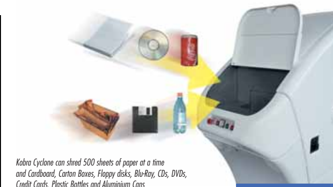
Kobra Cyclone can shred 500 sheets of paper at a time and Cardboard, Carton Boxes, Floppy disks, Blu-Ray, CDs, DVDs, Credit Cards, Plastic Bottles and Aluminium Cans

Kobra Cyclone is equipped with a turbine generating a high pressure air flow and sets of high speed rotating blades. By making the air stream spin, particles are subjected to centrifugal forces and deposited from the air flow into the disposal bag. This unique shredding system, delivers the highest shredding performance and efficiency along with maximum flexibility in choosing the correct Security and bulk reduction Level for a given application. Cyclone does not require the special maintenance and complicated oiling procedures that other machines with similar output rates do. Cyclone is designed for high volume shredding and maintenance free operation.