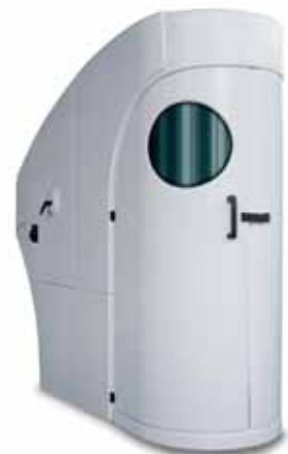
Rear window for easy checking of waste bag level