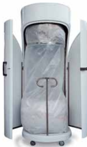
Kobra CYCLONE (standard version) Kobra Cyclone utilizes a plastic waste bag to store shredded materials in an internal storage compartment. Full bags are easily removed and disposed of assisted by the built-in-trolley