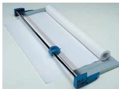
Convenient built-in paper rolls housing for easy cutting operations of large sizes of continuous paper