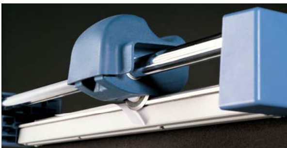
Special sharpened carbon steel blade to cut high thickness of paper