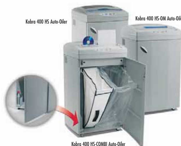
KOBRA "AUTOMATIC OILER" Integrated Automatic Oiling System of cutting knives

* KOBRA SHRED GUARD is intended as a device for extra protection of the cutting system. Operator's attention to the type of material being shredded is always required