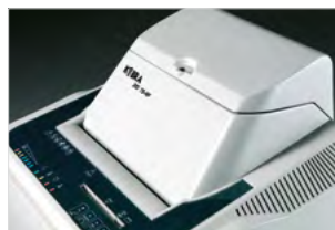
LOCKABLE COVER (LK)

It can shred automatically 170 sheets, whilst the operator can shred paper in the main throat and CDs/DVDs/Credit through the dedicated cutting unit, at the same time.