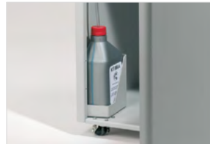
AUTOMATIC OILING SYSTEM

The lockable cover protects top-secrets or confidential documents waiting to be shredded when the shredder is left unattended. It is supplied with high security non-duplicable key.